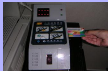
3b. 可以取回八達通卡 Remove Octopus card

*影印收費 Copying Charge: B/W 黑白 A4 每張 each HK $0.3 A3 每張 each HK $0.6