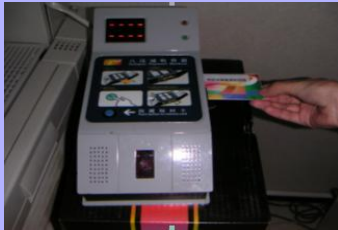
1a. 於機身右邊插入八達通卡 Insert Octopus card