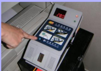
3a. 按收費器上的藍色按鈕 Press blue button on Octopus processor