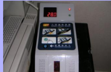
1b. 當收費器顯示八達通卡的剩餘數值後，便可開始影印。 Octopus Processor will show the usable value