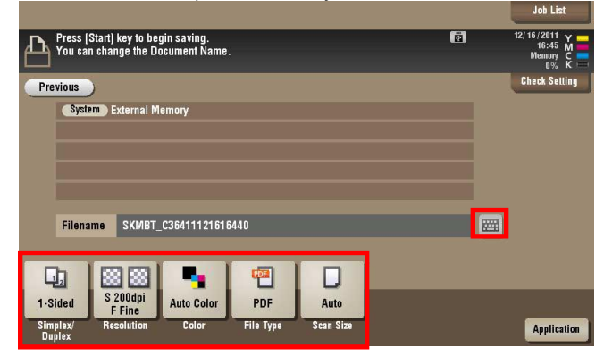
(vi) Select [Separate Scan] and [close].

iv) Change the Filename and setting (file type, resolution, etc) if necessary.